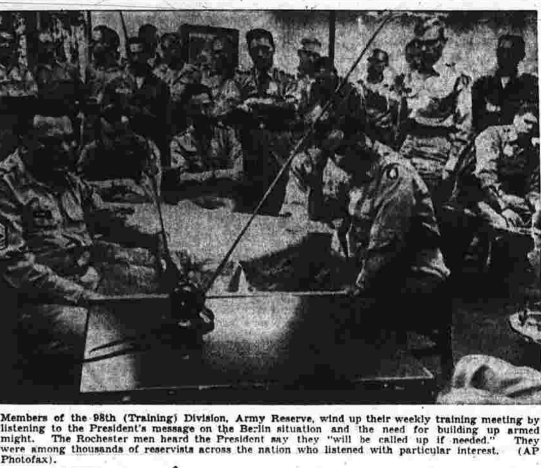
Members of the 88th (Training) Division, Army Reserve, wind up their weekly training meeting by listening to the President's message on the Berlin situation and the need for building up armed might. The Rochester man heard the President say they will be called up if needed. They were among thousands of reservists across the nation who listened with particular interest.

Police Smash $10,000 a Day Numbers Bank New Haven, July 26 (AP)—Police have broken up what they say is a $3-million-a-year "bank" for the numbers racket in Connecticut and New York state.